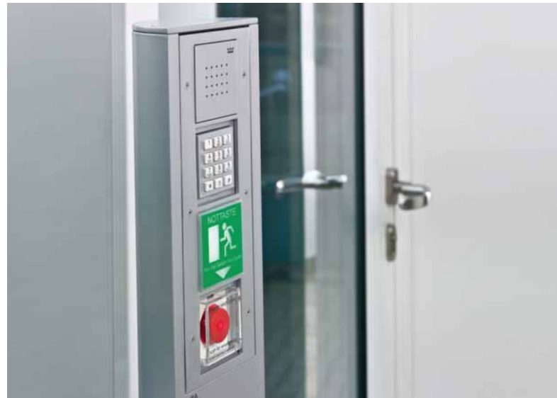
TMS emergency exit control system