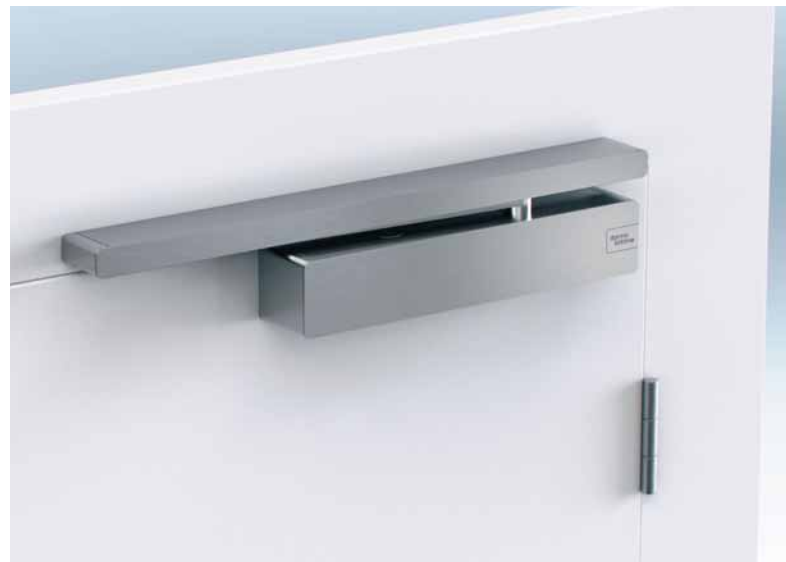
Sliding door closers